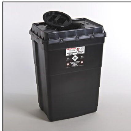
A hazardous waste container used for bulk