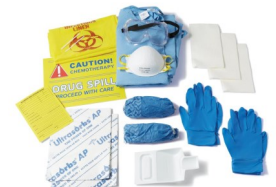
Example of a chemotherapy agent spill kit, which can be bulk waste once used.