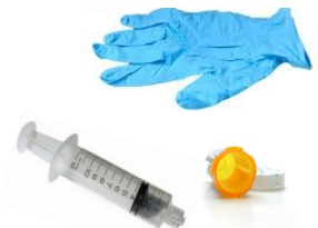
Examples of items that can be considered trace wastes.

Bulk chemotherapy wastes are materials that have been saturated with chemotherapy agents or are over 3% hazardous material by weight. This might include materials used to clean spills, IV bags that are not empty, or PPE that is soaked in these drugs.