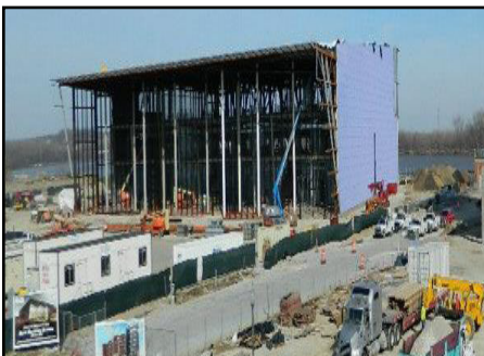
The city's convention center will draw business, boosting the economy.

? Leachman says sometimes they were asked to complete environmental field work within a tight time frame. Unusually wet conditions made this large project more difficult.