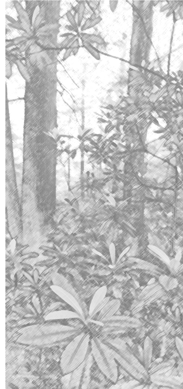
rendering of a photo by Pam Spaulding

KENTUCKY STATE NATURE PRESERVES COMMISSION 801 Teton Trail Frankfort, KY 40601 (502) 573-2886 www.naturepreserves.ky.gov