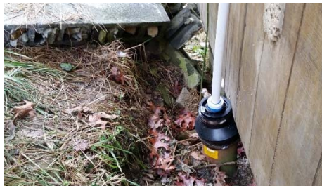
Figure 4 - Methane Gas Complaint, Vented Well Head