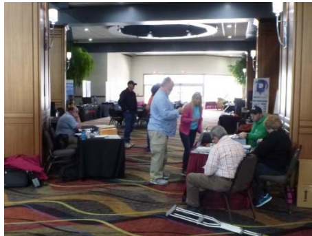
Figure - 12 2107 KYGWA Tradeshow and Workshop

The annual Kentucky Groundwater Association (KYGWA) tradeshow and Workshop was a success again this past March 2 nd and 3 rd in 2017. The KYGWA now has a new website. Look for future updates for the annual tradeshow and workshops at http://kygwa.org/ . An application for membership and attending the tradeshow are located on their website along with a letter updating the organizations progress. The KYGWA expects this year's tradeshow will be largest on record with a larger than normal turnout. The DOW will be there a usual to document attendance for the training available and to discuss any issues or needs you may be having.