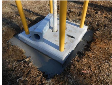
Figure 7 – NOV for Improper Pad Installations

Some of the complaints involved drillers and property owners that violated regulations such as set back distances, a gravesite being placed too close to a domestic well or a domestic water well being placed to close septic system. These were some of the issues addressed this year. Several other well owners reported problems with drillers or well construction. Most were easily rectified. See figures 7 through 9.