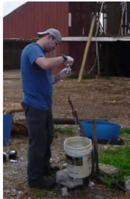
Figure 10 – Groundwater Monitoring Network Sampling Program

The GW section provided technical assistance to many of you, concerning regulatory issues, variance requests, well construction and well abandonment. The GW section fielded hundreds of inquiries concerning groundwater issues and well installation requirements from the public and continued to sample wells and springs in the DOW's Groundwater monitoring program, see figure 10.