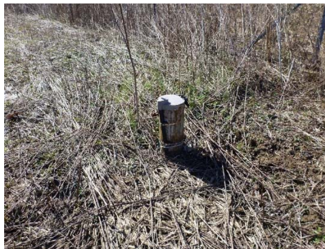
Figure 5 – Pre-Law Water Well Inspection