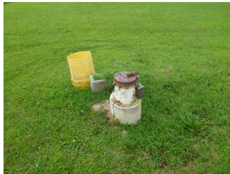
Figure 3 – Well Contamination Complaint and Inspection