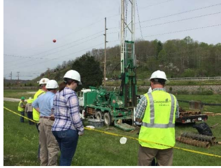
Figure 2 – Groundwater Section Personnel Performing Monitoring Well Audit