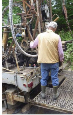
Figure 9 – Well Audit Water well installation

The GW section provided technical assistance to many of you, concerning regulatory issues, variance requests, well construction and well abandonment. The GW section fielded hundreds of inquiries concerning groundwater issues and well installation requirements from the public and continued to sample wells and springs in the DOW's Groundwater monitoring program, see figure 10.