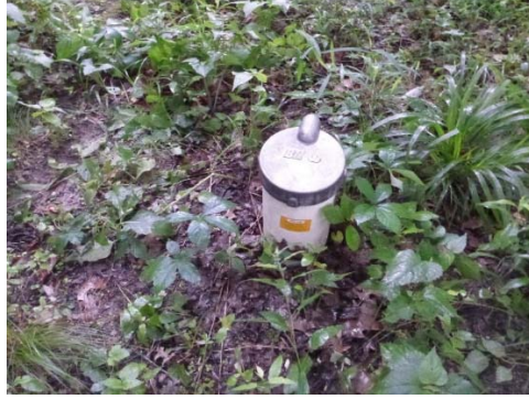
Figure 6 – Post Law Water Well Inspected and Tagged Driller Unknown

Some of the complaints involved drillers and property owners that violated regulations such as set back distances, a gravesite being placed too close to a domestic well or a domestic water well being placed to close septic system. These were some of the issues addressed this year. Several other well owners reported problems with drillers or well construction. Most were easily rectified. See figures 7 through 9.