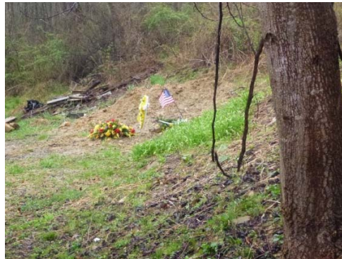
Figure 8 – Set Back Distance Violation Grave Site to Close to Existing Water Well