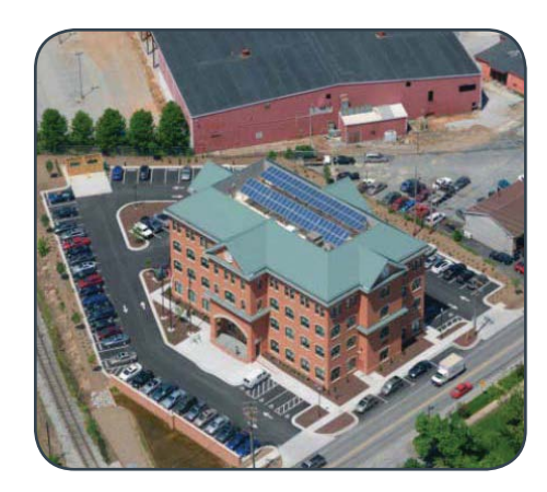
From left to right: Ranson Civic Center, rendering of green infrastructure stormwater management technologies, and American Public University Health Center, all in Ranson/Charlestown Commerce Corridor

with one of the nation's major collections for research in military studies and military history. The building can house 330 employees and already produced 170 initial new high-skills jobs.