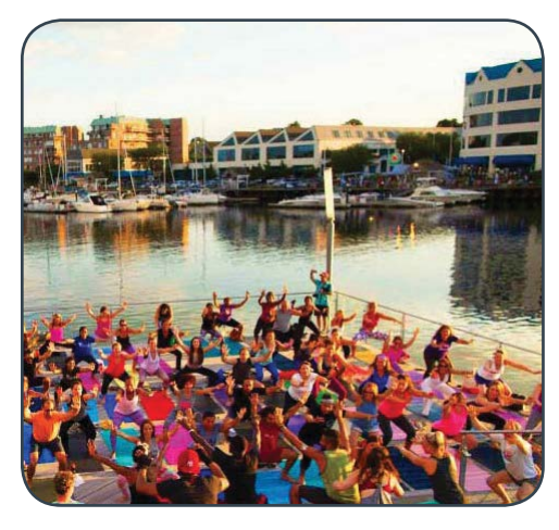
Yoga in Commons Park on former brownfield, Stamford, CT

The following sections of this guide are intended to help local communities develop more effective strategies for leveraging resources for brownfields and community revitalization endeavors.