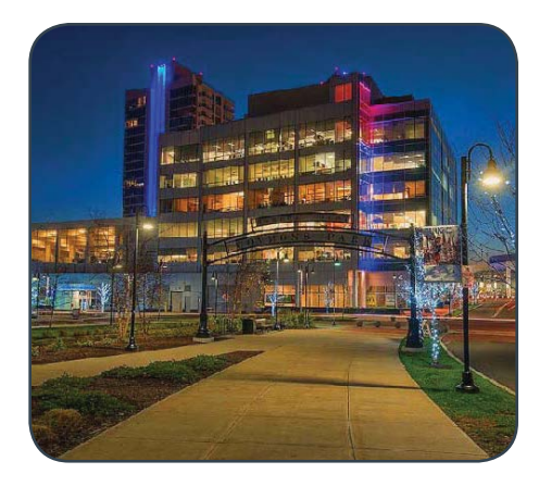
Retail furniture business and market in a mixed use development at Harbor Point development, and nearby Commons Park

Bus and Bus Facilities grant programs, the Federal Highway Administration's (FHWA) Job Access and Reverse Commute and Intelligent Transportation Systems grant programs, and other funding sources for the Stamford Urban Transitway, a new complete-street corridor providing access to the brownfields area and the Intermodal Transportation Center. FHWA also provided $1.1 million to improve streetscapes in the Waterside neighborhood and reconstruct the West Main Street pedestrian bridge connecting distressed areas of the community to the Intermodal Transportation Center.