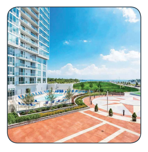
Waterfront housing at the Harbor Point development

The public funding that began with support from EPA's Brownfields program has leveraged $5 billion in private-sector investment. Investments include the Harbor Point and Metro Green projects, which are LEED gold-certified, mixed-use, transit-oriented development projects that incorporate luxury living space along with affordable and workforce housing, food and retail, nightlife, parks, schools, and waterfront activities.