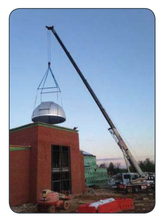
Dome being placed on top of the new APUS Information Technology Center

APUS Information Technology Center: APUS also will seek LEED certification for its Information Technology (IT) Center, which was completed in late 2015. The IT Center was built on the former Maytag appliance manufacturing facility in the Commerce Corridor. The large brick building includes a metal dome that houses a 240-pound, state-of-the-art telescope that will provide a new other-worldly view to the people of Ranson and Charles Town, and to APUS students across the globe who can remotely access the telescope. The IT Center also has an outdoor pavilion for musical and cultural events.