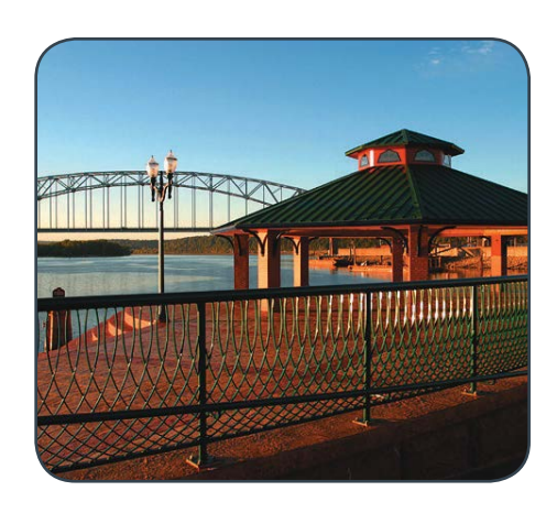
From left to right: The Grand River Conference and Education Center; Historic steamboat moored by the National Mississippi River Museum & Aquarium; and a pavilion along the Mississippi Riverwalk and River's Edge Plaza

ties in Dubuque in 2009, they toured and were briefed on the Port revitalization activities, which helped Dubuque continue the resource -leveraging effort.