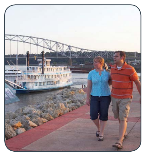
Couple strolls along the new Mississippi Riverwalk, part of the North Port revitalization

Reclaiming & Restoring the Mississippi Waterfront by Leveraging $400+ Million, Launched Through an EPA Brownfields Assessment Grant