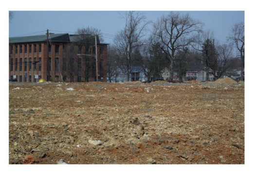
CARLISLE TIRE & WHEEL Closed - 2010