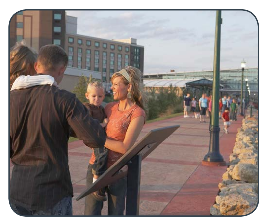
Family time along the Mississippi Riverwalk, part of the North Port revitalization in Dubuque, IA

Creating a Resource Roadmap can be very useful for developing a strategy for leveraging funding for brownfields and community revitalization. A Resource Roadmap is a document, sometimes in matrix form, that identifies revitalization priorities, their key components and phases, and the estimated cost for each project component and phase (or at least the most important next phases). The Resource Roadmap can be a handy guide for project teams pursing grant and loan funding. It also can be a great information tool to provide to local leadership (such as a city council) and funding champions (such as state and local legislators). The Resource Roadmap can help map out potential sources of funding and how to meet matching-share requirements for individual funding sources, as discussed below. (A sample/template for a Resource Roadmap is provided in Appendix 1.)