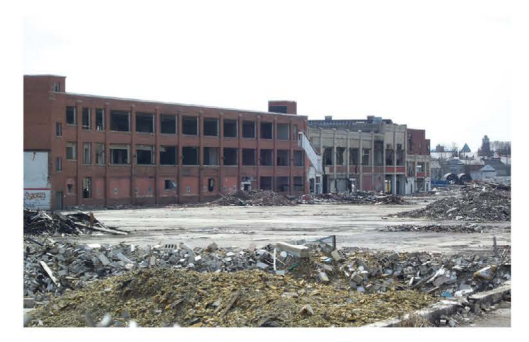
INTERNATIONAL AUTOMOTIVE COMPONENTS GROUP (IAC) Closed - 2008