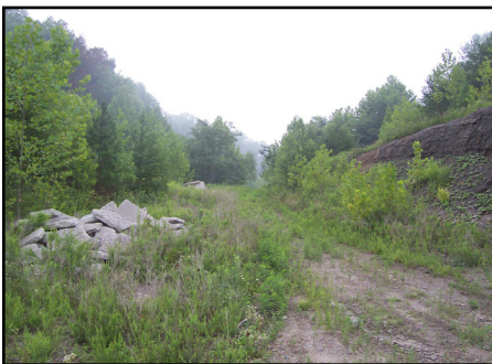
This is Happy Hollow Landfill before it was cleaned and redeveloped.

Middlesboro is in a flood-prone area. Before the project, the hilly land was valued at $10,000 per acre. After moving dirt to create level areas higher than the flood zone, the land's value is $200,000 per acre.