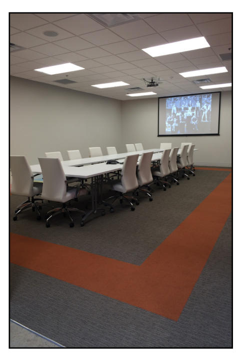
A conference room at Ruggles Sign

"I thought it was a shame to see this building idle, but the biggest