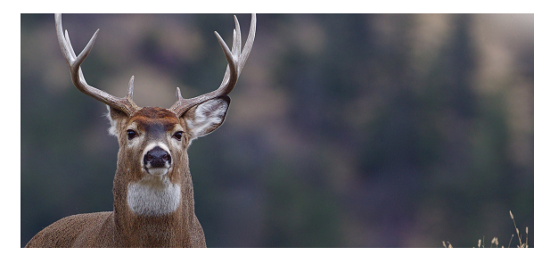
Improve habitat for our native wildlife species?