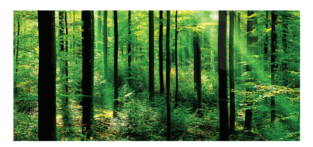
Increase the quality and quantity of your woodlands?