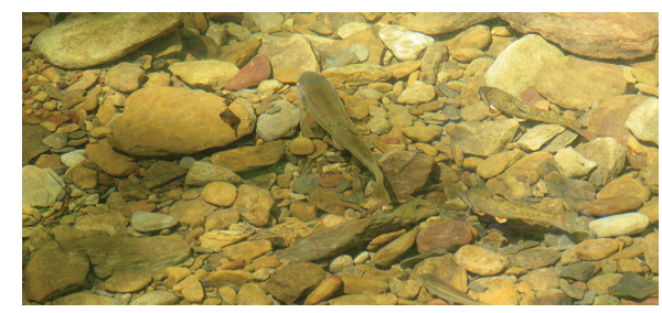
Improve your woodland's ability to provide clean water?

By completing the information below and mailing it to the Kentucky Division of Forestry Field Office that serves your area (see map page), natural resource professional(s) will contact you and arrange for a no cost/no obligation evaluation of your property. A plan will be developed to assist you in reaching your goals and objectives for your property.