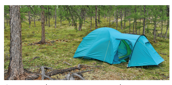
Improve diverse recreational opportunties and woodland aesthetic qualities?