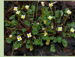
Kentucky glade cress