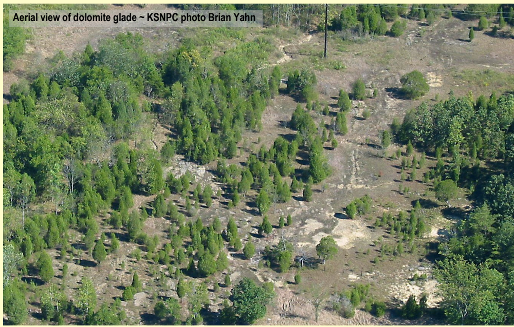
Aerial view of dolomite glade

restricted in growth due to droughty, poor conditions, but are more abundant in the surrounding woodlands/barrens. The few trees and shrubs that can withstand such conditions are often gnarled and stunted. These hardy species include blackjack oak, Carolina buckthorn, chinquapin oak, eastern redbud, eastern red-cedar, persimmon and post oak. The herb layer, often sparse, is dominated by drought-tolerant plants. Annual dropseed is the dominant grass in gravelly or bedrock areas, and little bluestem dominates in areas of slightly deeper soil. Characteristic wildflowers include bastard toadflax, elliptical rushfoil, false aloe, flatstem spikerush, gaura, hoary puccoon, Leonard's skullcap, obedient plant, pale purple coneflower, prairie tea, roundfruit St. Johnswort, scaly gay-feather, slender heliotrope and tall gay-feather. Common (but not necessarily abundant) species in the surrounding deeper-soiled prairie and woodlands include big bluestem, yellow Indian-grass, little bluestem, prairie rosinweed, tall gay-feather, tall tickseed and others.