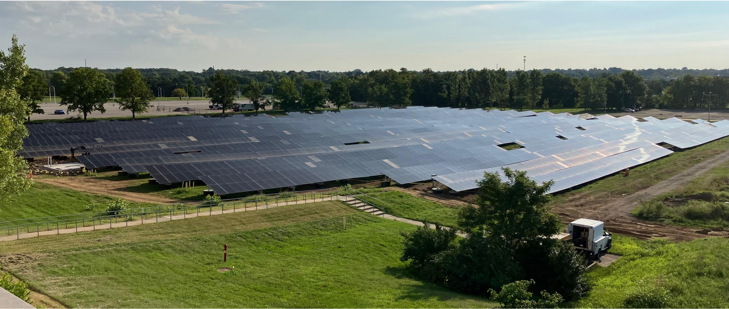
Lexington Solar Array – Late August 2022