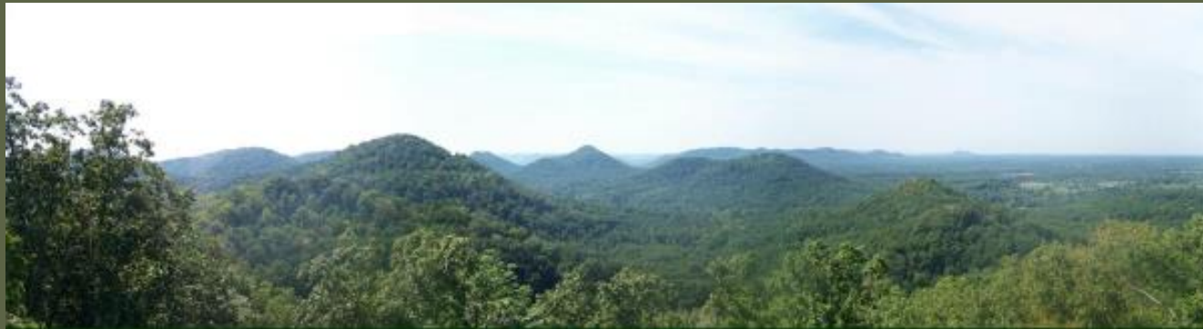
Lily Mountain Estill County Conservation District