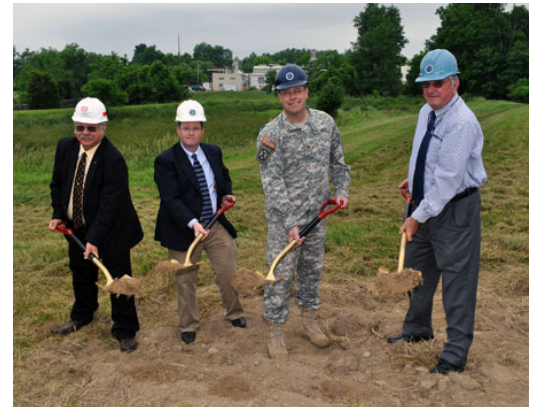
Coordinating agencies break ground with golden shovels.

These plans will now be put into place, as the ceremony marked the beginning of Phase II, occurring just a few months before Colonel Rogers' retirement and the appointment of Colonel Lee Hudson as BGAD commander. The physical cleanup work should be completed in 2013, with the required permit modification work completed by early 2015.