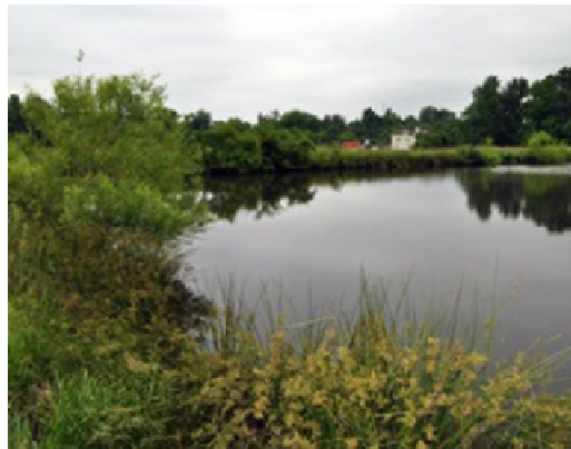
The TNT washout lagoons before remediation.

On June 3, 2013, a groundbreaking ceremony took place at the TNT Washout Lagoon at the Blue Grass Army Depot (BGAD).