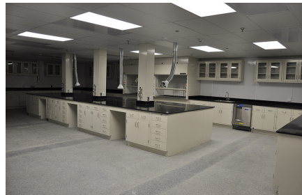
The lab where agent neutralization will be confirmed completed systemization in July.