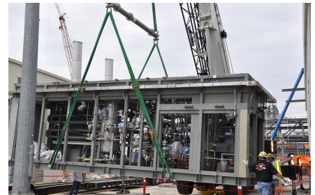
A neutralization module for the treatment of hydrolysate is guided into the SCWO Building.