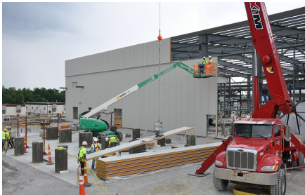
The Supercritical Water Oxidation (SCWO) Building receives siding.