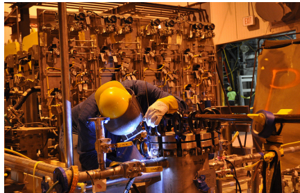
Piping for the Munitions Washout System (MWS) being welded.