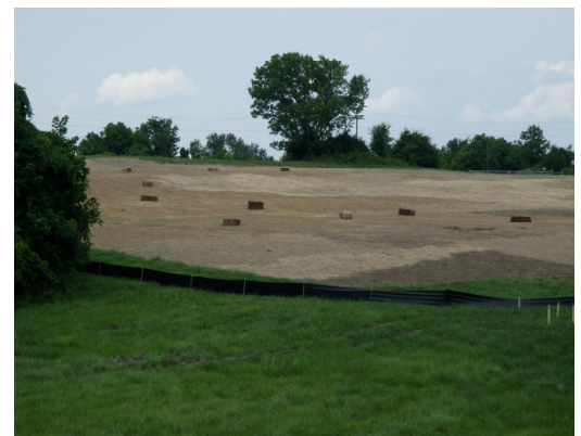
Hay applied to former lagoon area to encourage grass growth.

In attendance at the ceremony were representatives from BGAD; Kentucky Division of Waste Management's Permitting, Corrective Action, and Field Operations Branches; U.S. Army Corps of Engineers; and Military Project Management.