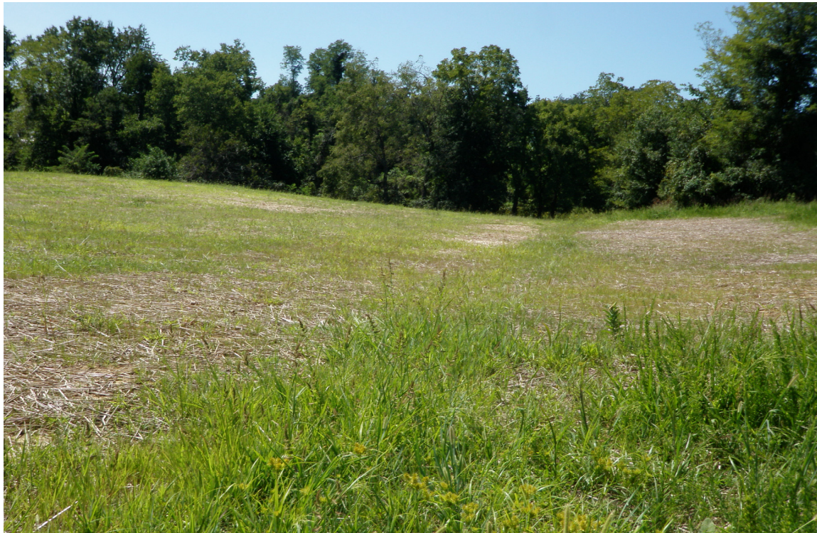
Recent photo of TNT Washout Lagoon remediation area