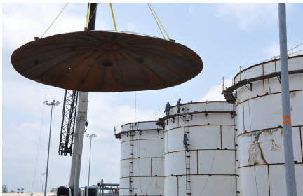
Hydrolysate storage area tank receiving a lid.