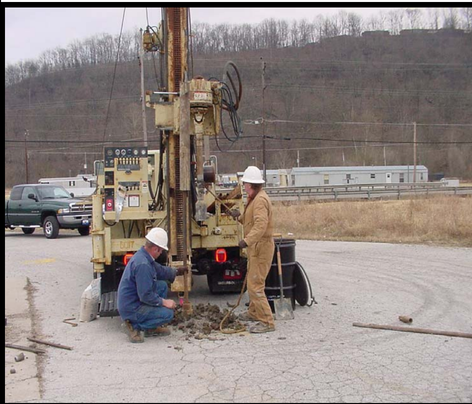
The Groundwater Branch would like the opportunity to observe the many different drilling methods of the Kentucky Certified Water Well Drillers throughout the state. These site visits to your drilling operation would be for educational purposes only and would not be part of a regulatory inspection. Please contact us if you have an interest in allowing us to visit your well site operation.