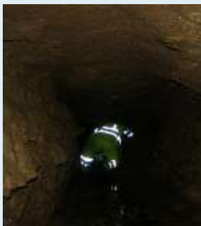
That's not water he's kneeling in!!