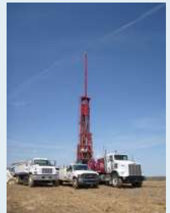
Kelly Well Drilling's New Reverse Air Circulation Drill Rig