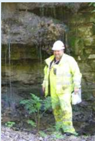
Coming soon to a drill rig or barbeque near you!