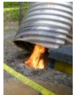
Same well, before proper venting