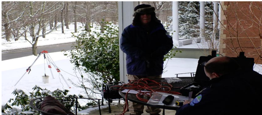
Groundwater staff video logging a water well, Ashland KY.

The well pump needs to be removed from the well at least 24 hours prior to the well camera inspection to allow any sediment in the water to settle out due to the pump being removed. The well water must be relatively clear to view all aspects of the well construction through the water column in the well. If you have a need for this service, please contact Scotty Robertson at 502-564-3410 or via email ( scotty.robertson@ky.gov ).