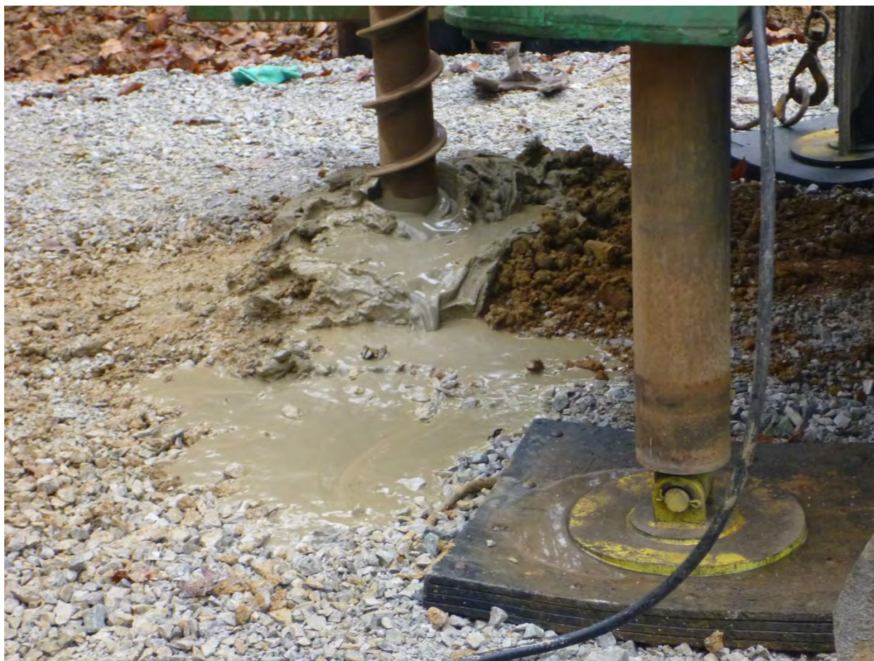
Striking water while advancing borehole for monitoring well installation in Lawrence County, KY.