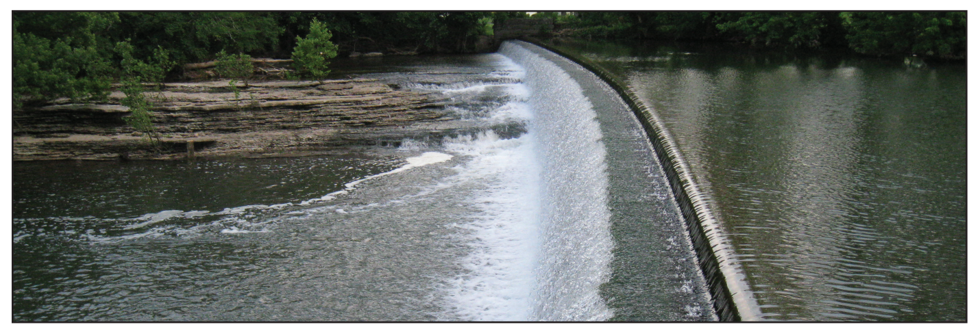
Low-head dam on South Elkhorn Creek

In the end, often the best sources of information about hydromofications are aerial photographs, maps, and members of your team or other locals. Small, low-head dams and historical stream channeling will not be identified by databases or permit programs. In almost all of Kentucky, a straight stream is one that has been altered, so look suspiciously at any straight stretch of stream. Ask locals about low-head dams, small stream obstructions built for various purposes. GIS coverage of dams is available from kygeonet