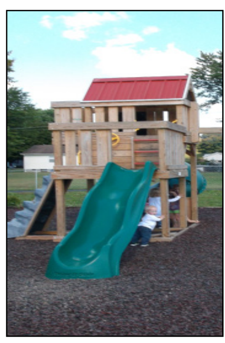
The park's playground is a popular place for elementary children to visit.

By making the decision to restore the site into a useful property, the city demolished an unsafe building, capped contaminated soil across the entire site and turned a dangerous property into a scenic park to be enjoyed regularly by the community. There is a walking track, which is in constant use. Since the playground is for smaller children, a local elementary school sometimes brings classes to the park to play. The basketball court is the scene of a heated ballgame among the boys nearly every afternoon after school. Memory benches donated by local citizens in honor of loved ones are very special and located throughout the park.