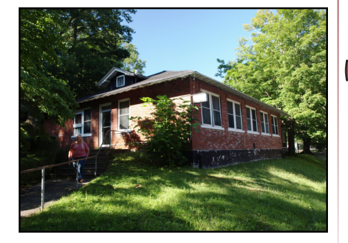
Former clinic in Benham

Overall, the CVADD region was extremely pleased with the outcome of the assessment grant, and as a result, two of the communities received $200,000 EPA cleanup grants. The City of Benham, located in Harlan County, Kentucky, received $200,000 in EPA Cleanup funds. The city plans to utilize the EPA funds for the cleanup of the former Benham Medical Clinic. Jackson County Ministries, received $200,000 for cleanup of Lincoln Hall,