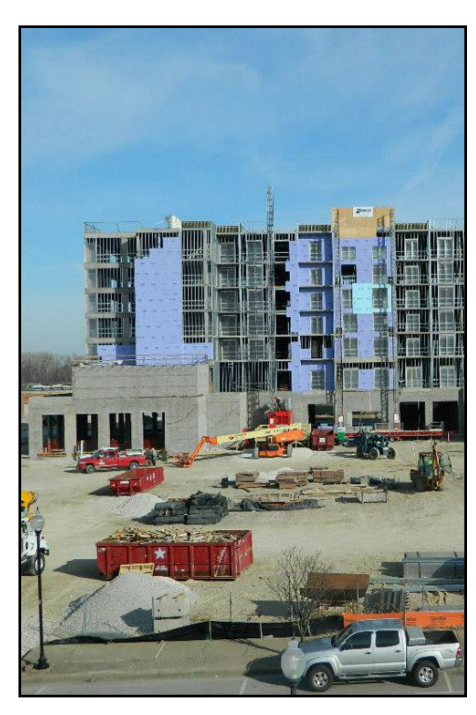
The Hampton Inn is shown during the construction phase on the riverfront.

In addition to tax revenue and several million dollars in the new development, results from the environmental success of the riverfront property include 100 new jobs and the