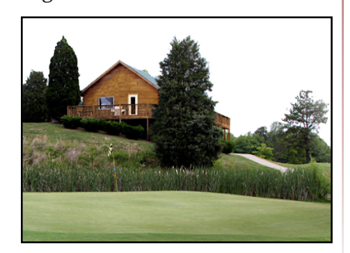
Sag Hollow Golf Clubhouse overlooks Hole # 2 in Booneville.

Green #3 had to be rebuilt, which cost $20,000. Some sand traps had to be redone, and it was necessary to watch the runoff when it rained and sent water running down the hill onto the greens. These are things that will be taken into consideration before construction begins on the next nine holes.