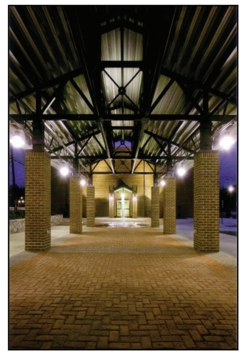
The canopy covering the walkways in the parking lot is an attractive pavilion.

Hard work has transformed this brownfield into an asset for the area. Now the location is a multipurpose facility with a business incubator, the Douglas Community Learning Center and job development opportunities. The Third Street Exchange is the crown jewel in an area that was once blighted, riddled with crime and empty storefronts and was an environmental mess. Now, it is fulfilling its intended purpose for the neighborhood in offering educational services and increasing incomes, asset accumulation and jobs for families through business ownership and self-employment.