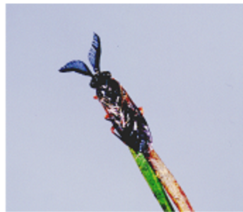
Fig. 2 Male European pine sawfly