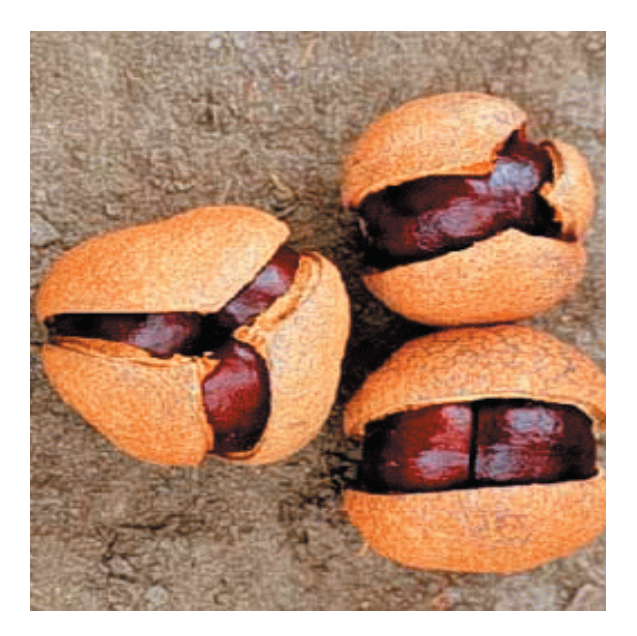
Buckeye fruit with seeds inside

Yellow buckeye has been hybridized with A. pavia and A. glabra to yield interesting hybrids with a range of flower color.