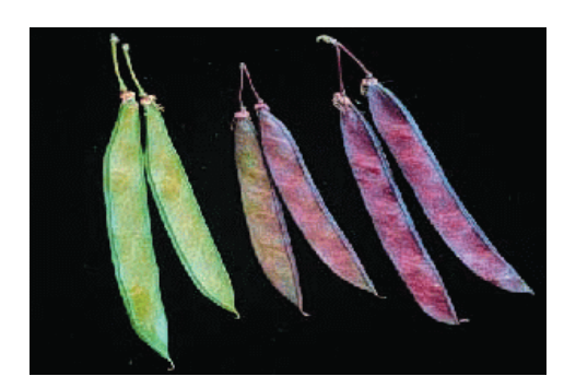
Fruit is a pod