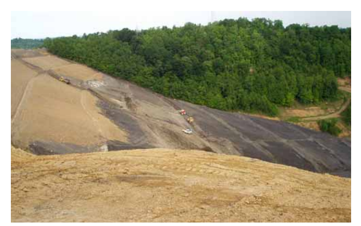
Reclamation in progress

In the late 1980s, a company named Enerpro attempted to extract the coal from the refuse on-site by running it through a