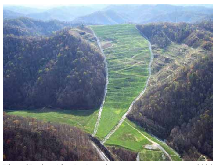
View of Project After Reclamation

After the Buffalo Creek waste dam failure in West Virginia, the Spewing Camp refuse dump received serious attention from MSHA and the Kentucky Division of Water Resources. The agencies were concerned that the refuse could slide into Spewing