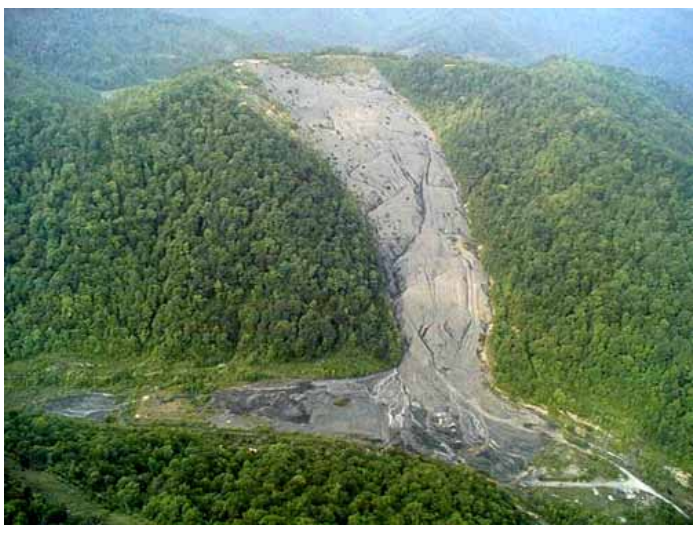
Aerial View of Refuse Prior to Project

Funding for the Spewing Camp Branch Refuse Project came from four different sources. The primary source, contributing $2.1 million, was the Commonwealth's Federal Abandoned Mine Land Grant. Also, $723, 297 in funding from the Appalachian Clean Streams Initiative, made available by the federal Office of Surface Mining, was used. DAML also contributed $406,665 from the state supplemental reclamation fund to supplement the forfeited Enerpro reclamation bond.