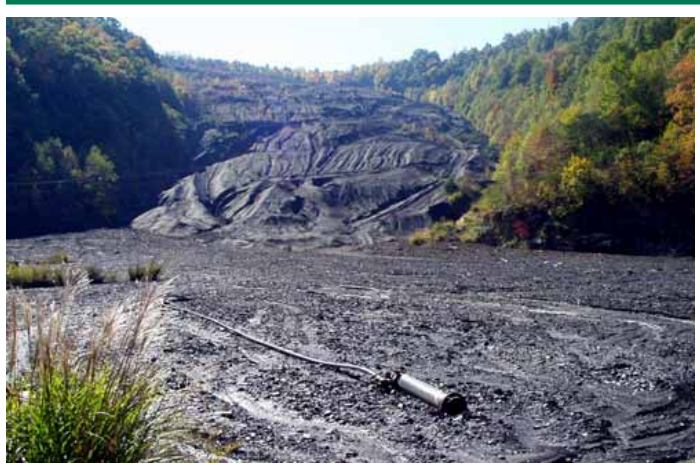
Refuse Dump on Spewing Camp Branch

Camp Branch creek and dam it up. Failure of that dam would cause catastrophic downstream flooding. Because of this concern, the creek was relocated to its present channel, farther away from the dump.