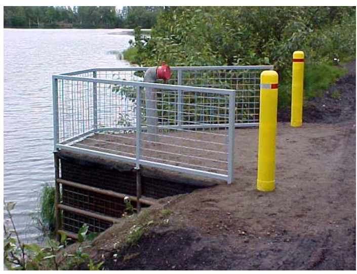
A completed multi-functional stand pipe facility