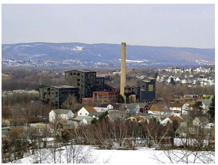
Cranberry Ridge AML Project, Hazelton PA

We have a great lineup of exhibitors to visit Sunday night as well as Monday and Wednesday, and we have received a good