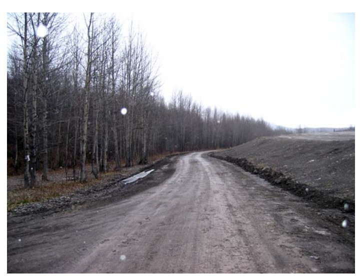
The height of the objectionable pile can be seen relative to the roadway that skirts it

What is next in the vicinity? The area around Coyote Lake saw AML Program highwall mitigation efforts over a decade ago. This enabled a wide variety of recreational users to enjoy the area. The access road to this project was never rebuilt to support the construction equipment moving to the site. As a result the only access to the area presently is by ATV on a deeply rutted and eroding roadway. This generates sediment flows into the anadromous stream, Eska Creek, just down slope from the lake. During the summer of 2010 we plan on working with the Sutton Community Council, the Matanuska-Susitna Borough (landowner at Coyote Lake), Cook Inlet Region Incorporated (the native group who owns the land where the majority of the offending roadway is located), and the Alaska Department of Transportation to try to find some cost-effective way to mitigate this unintended consequence of a past project and once again allow a wide spectrum of recreational users to access the lake.