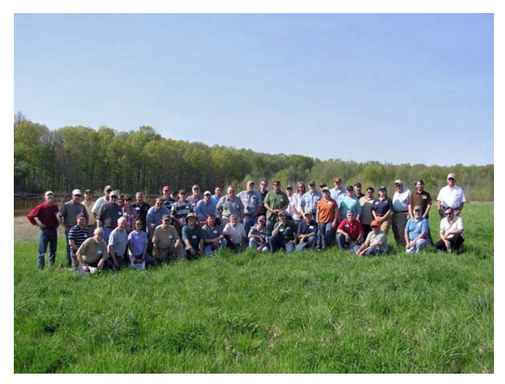
AMD Workshop attendees at the Sunlight Sulfate Reducing Bioreactor in Southwest Indiana on April 13th, 2010.

Participants also visited AMD-affected sites in Southwest Indiana that were in varying stages of reclamation, including Log Creek Church, Augusta Lake, and Midwestern (all completed Passive Treatment Systems), Enos (a Passive Treatment System that received maintenance in 2009), Firepit (a pre-construction site for a planned Passive Treatment System), and Sunlight (a completed Sulfate Reducing Bioreator). These site visits allowed attendees to experience the implementation of AMD treatment technologies in real-world settings, as well as better understand the complexities, challenges, and opportunities involved in AMD remediation.