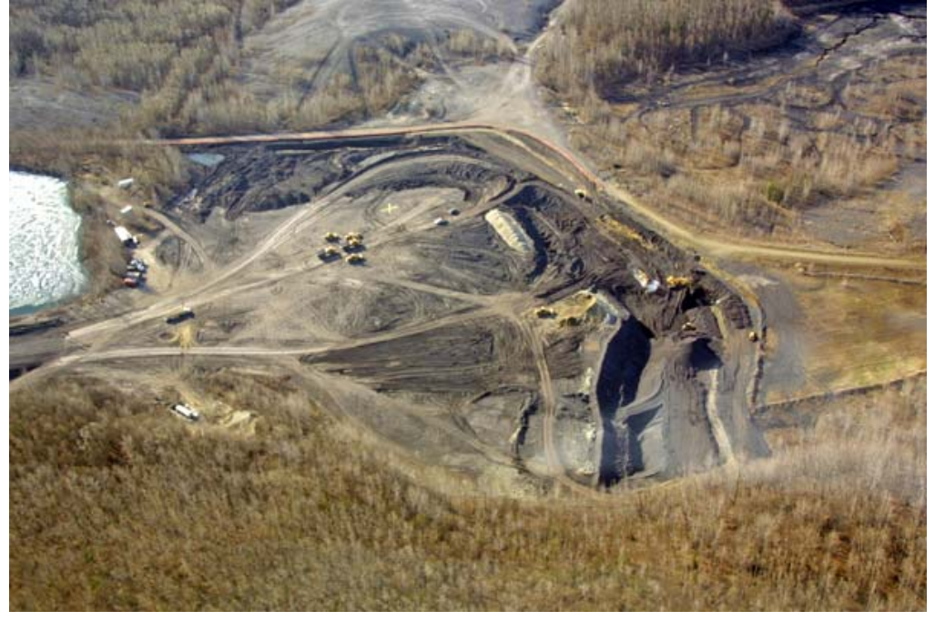
Aerial view of Phase I Jonesville Fire

One access road leading to the project area was partially rebuilt in conjunction with Phase II and the other was rebuilt as a stand-alone maintenance project in 2009. Even though many measures have been taken to protect the water clarity of Slipper Lake, there remains sediment potential from the flat that was left after the pile was removed from the Phase I area. To eliminate this once and for all, the area will receive a one foot layer of rock applied in two lifts and compacted in place that will keep the water that does migrate off-site