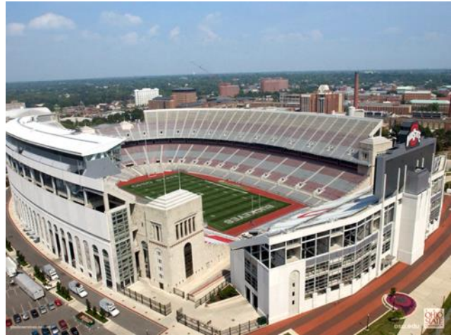
Ohio Stadium – Ohio state University

Travel to the epicenter of activity in Columbus during fall Saturday afternoons for a behind the scenes tour of Ohio Stadium , the home of the Ohio State Buckeye football team. Listed in the National Register of Historic Places, and constructed in 1922, Ohio Stadium was once the largest poured concrete structure in the world. Many facets of the stadium and its history will be explored. Next up is a tour of German Village, a nationally registered historic neighborhood in Columbus, Ohio, and lunch at Schmidt's Restaurant and Sausage Haus . German Village was settled in the early-to-mid-19th century by a large number of German immigrants, who at one time comprised as much as a third of the city's entire population. In the afternoon, you will learn how fine chocolates and mead are made with visits to Anthony Thomas Chocolates and Brothers Drake Meadery .