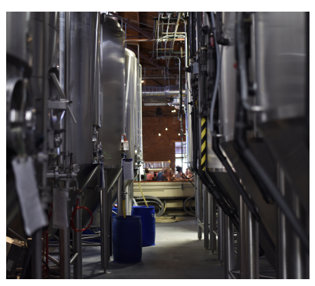
Benchmarking improves performance while promoting resource stewardship and supporting sustainability goals.