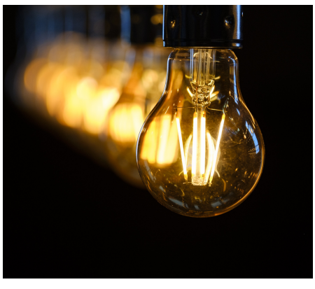
Benchmarking can have annual energy savings of 2.4%.

The three types of benchmarking are internal, competitive and strategic. Internal benchmarking is used when a company has made improvements and wishes to compare the new performance measure with a previous performance measure. Competitive benchmarking is used when a company wants to evaluate itself compared to others within its sector. Lastly, strategic benchmarking is used when identifying and analyzing world-class performance. This form of benchmarking is used when a company wants to go outside of its sector to evaluate its best practices and performance. In essence when it comes to benchmarking, an entity can choose to compare itself within the organization, to peers, and/or to a world class performance measurement.