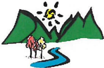
Division of Waste Management

A comprehensive manual for establishing an effective office paper recycling program for businesses, schools, and municipalities of the Commonwealth.