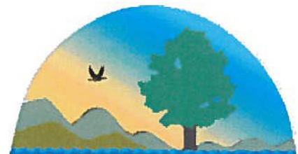
Energy and Environment Cabinet