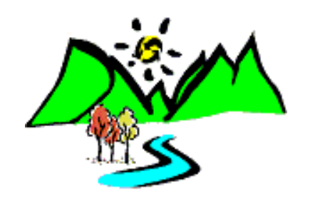
Division of Waste Management

A comprehensive manual for establishing an effective office paper recycling program for businesses, schools, and municipalities of the Commonwealth.