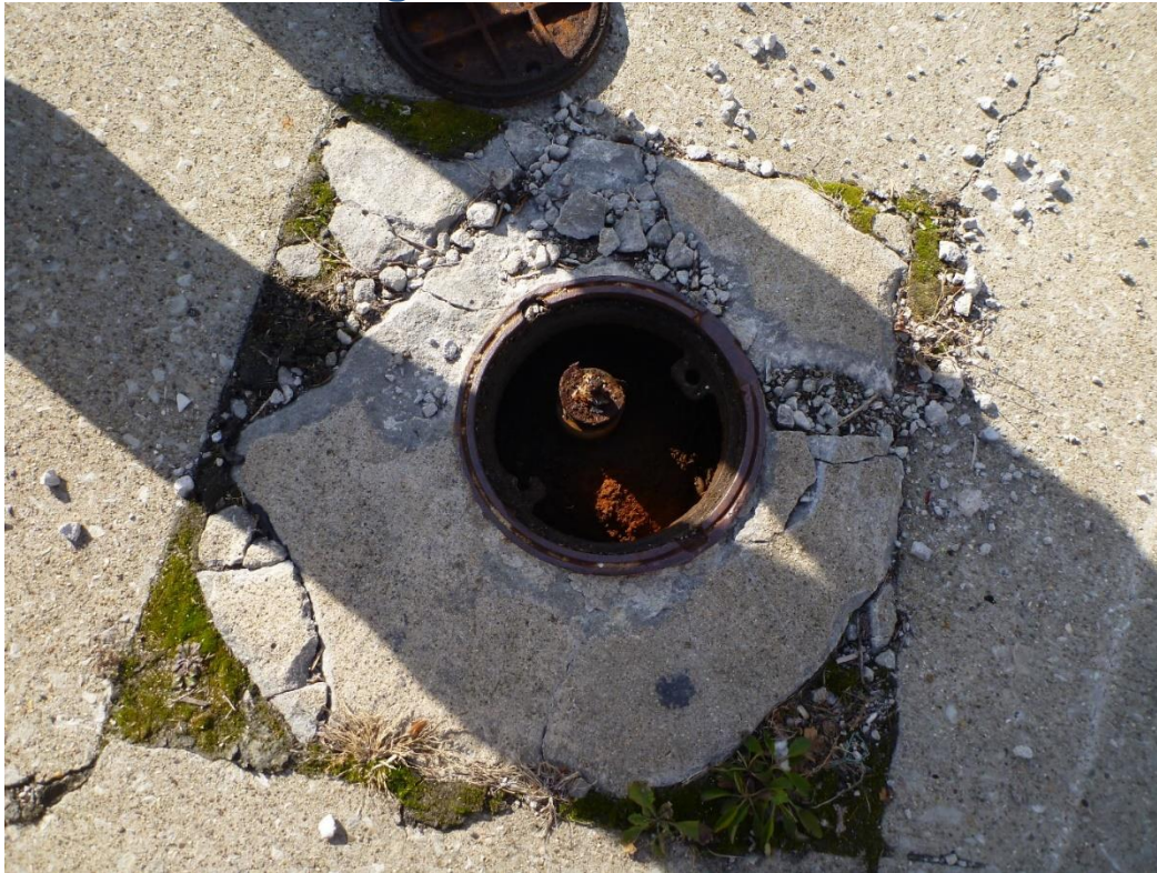
Photograph was taken by member of Groundwater Section staff.

The Division of Water is Celebrating the 25 th Anniversary of the Groundwater Protection Plan Program. Groundwater monitoring is one of many activities covered by 401 KAR 5:037. This monitoring well was inspected by Groundwater Section staff on 11/14/2019 in Henry County, Kentucky. As environmental remediation projects age so does their infrastructure. Kentucky Energy and Environment Cabinet personnel are finding more and more monitoring wells in conditions like this well. Monitoring wells found in such condition should be repaired or properly abandoned by a certified monitoring well driller and a Kentucky Uniform Well Maintenance and Plugging record completed and submitted to the Division of Water by the certified driller.