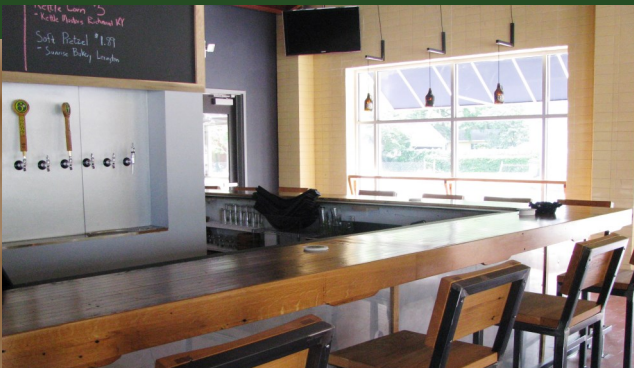
Wood from the loading dock and UK Memorial Coliseum was used in the bar area.

Another measure of success is that West Sixth Brewing Company is the first Kentucky brewery to can its beer and has the ability to produce 1,200 barrels per month.