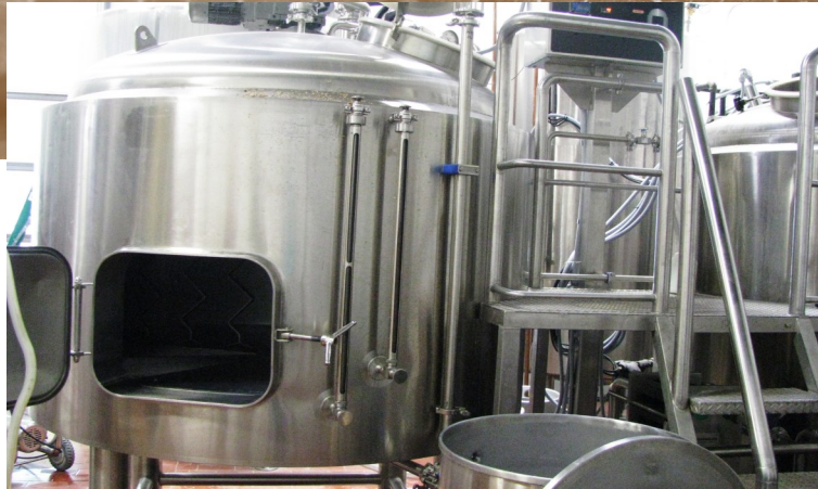
Brewhouse at West Sixth Brewing Company

A brownfield was transformed into a popular entertainment and business center.