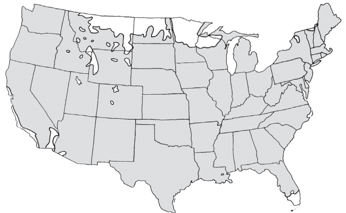
Figure 2. Range

Availability: somewhat available, may have to go out of the region to find the tree