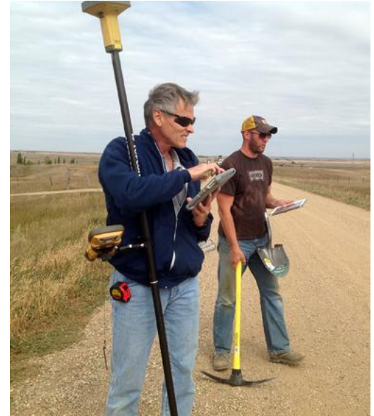
AML using GIS on the iPad in the field.

AML is currently using iPads on a drilling and grouting project near Beulah, ND. Holes were drilled along the road and ditch the previous year and their locations recorded with GPS. The drill holes had been capped off, buried just below the surface and markers placed beside them with pink top stake chasers. These cased drill holes with voids were now being filled with grout in an attempt to stabilize this extensively undermined area. The iPad displays the map of these locations and gets within proximity of missing markers. Progress is tracked through data collection as voids are filled with grout.