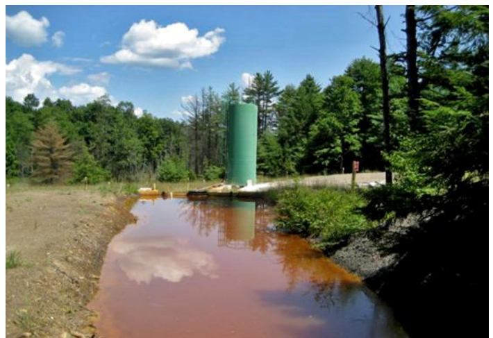
Tipping bucket lime doser treating AMD Discharge No. 17 PA 1934

Before the project ended, the group graded 320 acres, and replanted it for the resident elk herd. They reclaimed ten highwalls of more than 30-thousand linear feet. They mined more than a half-million tons of limestone to provide alkalinity in the stream and in the reclaimed sites, moved more than 5000 cubic yards of coal waste, closed 23 old mine openings, installed five wet seals, and treated 14 AMD discharges.