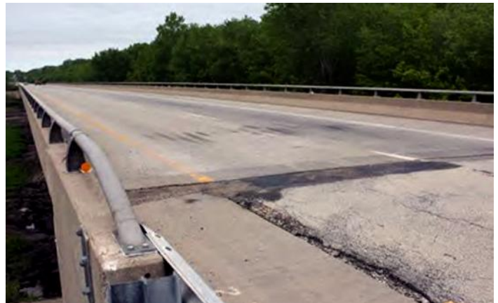
Skid marks from cars momentarily becoming airborne due to the sinking of the bridges.