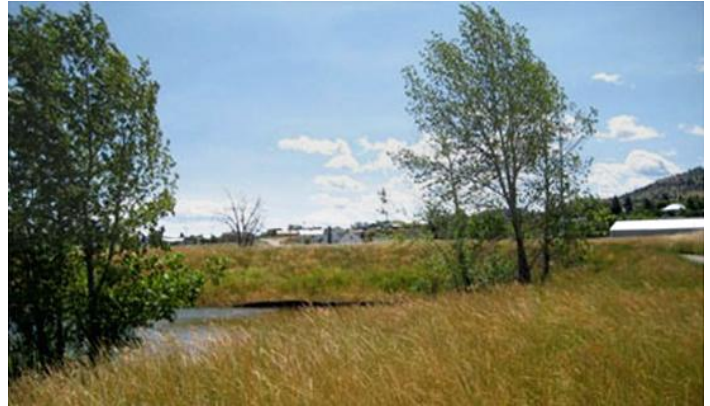
Spring Meadow Lake State Park today, where the contaminated soil was removed. The park hosts about 85,000 people each year to swim, fish, canoe, picnic and play.

Testing indicated arsenic levels in the lake exceeded drinking water standards by 20 times the limit, and high levels of heavy metals. Fortunately, the recreational beach areas were not contaminated, and fish and aquatic insects were not bio-accumulating heavy metals. The state reassessed its mine site reclamation priority list; Spring Meadow rose to the top by a large margin due to the volume and toxicity of the wastes at the site.