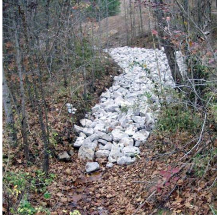
An example of the limestone channels created to help increase PH levels in the watershed.

The results speak for themselves. At Robert's Hollow, average PH rose from 3.1 to 5.8 after the project was completed. The change is mirrored at White Oak Creek, Paint Cliff and Lower Rock Creek. Through the entire system, the project reduced the monthly acidic load in the water by 99%. As a result, fish and other aquatic life and land-borne animals have returned to lower Rock Creek and White Oak Creek.