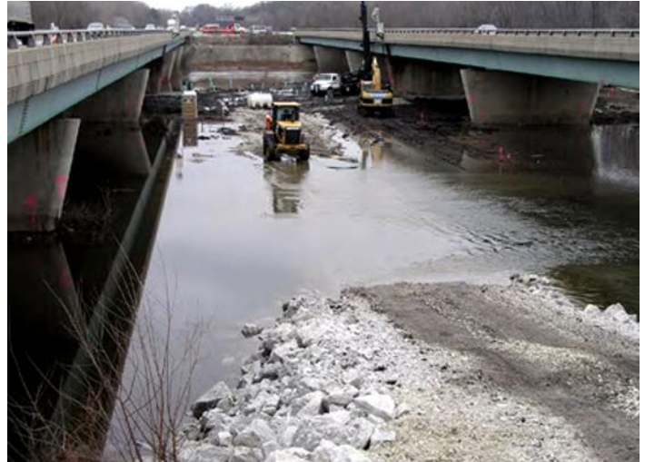
The twin 800-foot Interstate 72 bridges over the Sangamon River in Illinois.

In December, state AML officials began 24 hour monitoring of the bridges, collected data, and confirmed the suspicion that three ongoing mine subsidences - one at each end of the bridges and one in the middle - were causing land under the bridges to sag. They determined the cause of the subsidence were two underground room and pillar mines last operated in 1931 and 1951, about 200 feet down. In turn, the subsidence caused warping and damage to parts of the bridge pier supports. A state engineer warned that because of their unique design characteristics, the bridges could not handle uneven sagging from the sinking ground, and said failing to act could lead to the loss of one or both bridges, and of human life. The state moved quickly to address those threats.