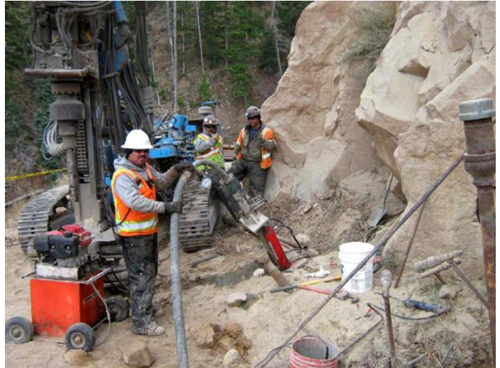
Workers had little room to work while drilling the boreholes to locate the fire, and then inject fire retardant to extinguish the fire.

The mine in question began operating in 1919, then closed in 1945, when the underground fire ignited. By the time the state program came into existence in the 1980's, what was thought to be one fire had spread into several, with fissures, crevices, and landslides allowing oxygen in, and multiple seams of coal were burning. A full acre of land had slumped because the fire had burned away underlying coal. In addition to threatening air quality, the fire created several public safety hazards.