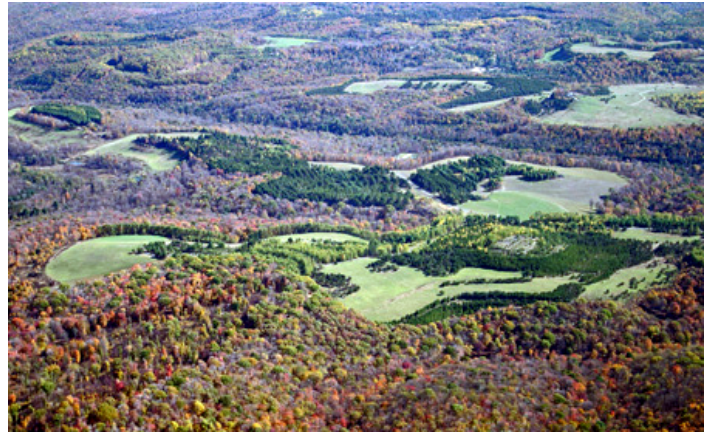
A small portion of the 25 square mile Dents Run watershed area.