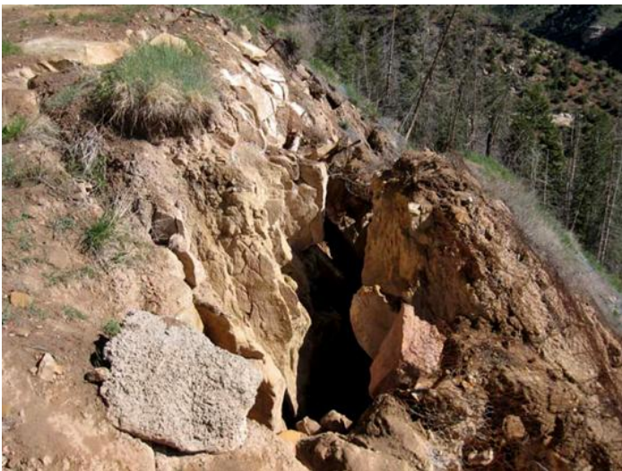
An example of the many crevices that formed as the fire migrated underground. Some cracks were large enough to swallow large animals.

The ground surface near the fire was prone to caving underfoot; some crevices were large enough to swallow a person or livestock. The fire also threatened to ignite forests above ground. Even though the state reclaimed the area in the mid-80's, sealing mine portals and burying coal refuse piles, the fire raged on.