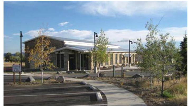
The state converted the old ore milling site, including some of the old structures, into the new Montana Outdoor Discovery Center, which provides visitors with opportunities to learn about wildlife and nature.

Cleaning up the park required a two-pronged approach. Some of the soil was contaminated so lightly that it could be transported to a lower-level disposal site in Montana. Other soil and sediment, however, was so badly contaminated it would require heavier treatment or transport out of state. The team excavated about nine acres of lightly contaminated soil at a depth of 3 feet. They removed 65,000 tons, which was treated and hauled away to an approved disposal site.