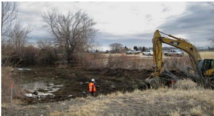
Contaminated soil is removed from Spring Meadow Lake.

The project removed waste from gold, silver, zinc and manganese processing dating from 1910 to 1920.