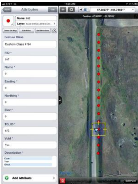
Screen shot of GIS Pro on the iPad.

The AML construction inspector is also inventorying area sink holes using the iPad. Location points are recorded. Data is collected including photos. This will become a resource for AML in assessment of danger levels of these sink holes.