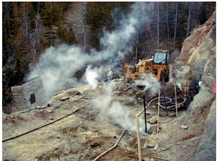
Workers on a steep-slope drilling pad as part of the effort to extinguish the Maclean mine fire.

One of the biggest challenges was determining the exact location of the fires. By 2010, foot wide cracks appeared on the mountainside about 170 feet above the old mine site. Using signs on the surface proved unreliable, even using infrared photography. To determine the location, project managers drilled dozens of boreholes and modeled the data in three dimensions, then overlaid the data on traditional geologic and mine working maps. The fire affected an area that covered 400 vertical feet on very steep slopes. Creating work pads to drill the boreholes and build seals were difficult.