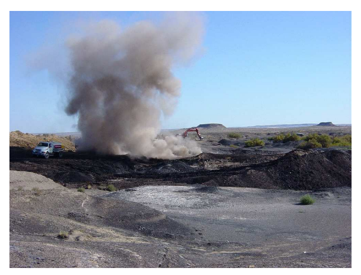
Looking to the north at the early stages of the coal outcrop fire excavation with a bulldozer. The water truck is nearby for dust suppression. Due to the amount of ash and high heat present, this was a slow excavation process.

lightening or burning trash. This project was completed within 15 calendar days using a basic cut and fill methodology. The excavated material was thoroughly mixed with water and natural soil to ensure the fire was out. This was the first coal fire project addressed by the Navajo AMLR Program.