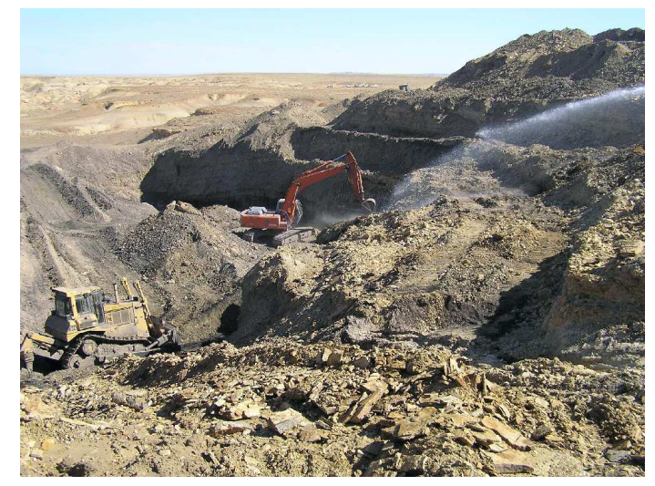
(Before) Looking to the northeast. The combination of the excavator and bulldozer are excavating the coal fire seam while the water truck is providing water from an above bench. The excavation process is being performed in a series of cuts working up to three (3) levels. Following the full excavation, the overall area was backfilled with a series of natural benches for drainage control.

In 2005 a local individual reported that another coal outcrop fire was burning near their residence located on a flat plain adjacent to Chaco River. The second coal fire project consisted of