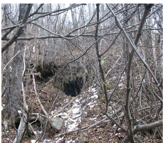
Old mines lure bears in Alaska