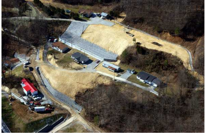
Aerial view of the completed Belfry Projet