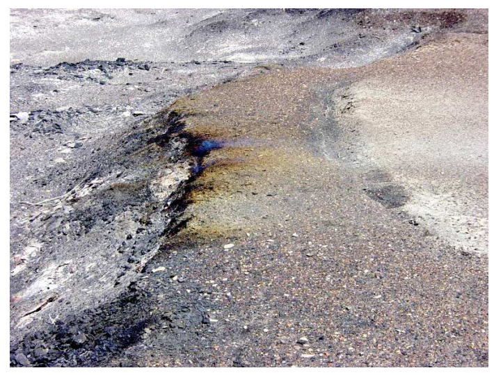
Looking south at the coal outcrop fire line. Fire is progressing to the west. You can see the ash to the left and the smoke in the middle and the natural ground to the right.

Window Rock, AZ (Navajo Nation) - The natural carved formation made of gray and white clay creates a natural beauty called "Bisti tah" (Badland) and Chaco River Valley, a scenic attraction that many tourists travel to northern New Mexico for viewing and photographing. There is a small Navajo community called Burnham, with approximately 200 Navajo families residing within a 25 mile radius along the historic highway 666 (renamed to Highway 491) which is north between Gallup and Shiprock, New Mexico. Within the Burnham area lies a large coal reserve with an estimation of over 2 billion tons. Currently, there are three large strip mining operations on the Navajo reservation with approximately 18 million tons of coal that is mined on an annual basis. The coal strip mining industries contribute to the economy of the Navajo Nation and provide coal to operate three (3) power plants which light-up the Western United States and the surrounding areas. The Navajo Nation also receives Mineral Royalty Payments and AML funds through coal taxes pursuant to the Surface Mining Control and Reclamation Act (SMCRA) of 1977.