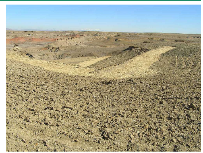
(After) Looking to the northeast. The final contour of the coal outcrop fire with multiple benches for drainage control installed. Some revegetation was implemented and overall rough grading installed.

Senior Public Information Officer: hcharley@frontiernet.net