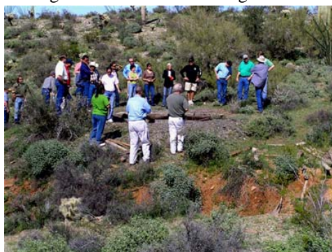
Field Trip - abandoned mine opening.

The field trip successfully showcased abandoned and current mining in Arizona and revealed strategies for reclamation. The Association is grateful to the Navajo AML program for assembling and hosting the 2008 Winter Meeting.