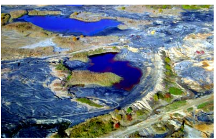
Aerial view of the Panther Tipple site.

The rolling land changes from green to brown and black leading up at the former coal mine and site for Green Coal Co. in the community of Panther on Kentucky 554 in Daviess County, south west of Owensboro.