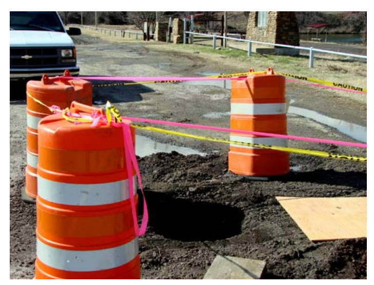
McCurtain Park Sinkhole

A sinkhole opened in the parking area of the McCurtain City Park a quarter mile west of the town of McCurtain (population - 466). The park is on State Highway 31 and is heavily used by the public because there is a water-filled strip pit that is a part of the park. Underground mining preceded the strip mining many years ago. The sinkhole was 4 feet in diameter and 11 feet deep. The sinkhole was reclaimed at a total cost of $7,919.20.