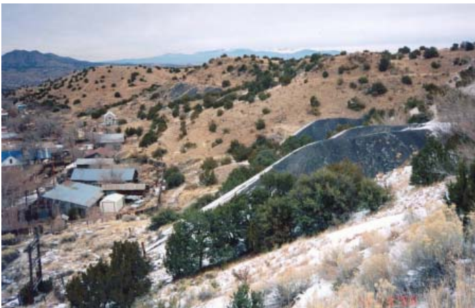
After several decades of exposure, gob piles remain without significant vegetation. The piles experience significant erosion off the steep slopes and sediment deposition onto flatter slopes and into drainages.

The restoration and dynamic stabilization of the main stream through Madrid, channelized during the mining period, would require the cooperation of several landowners and the avoidance of historic structures along the path of the stream. Given the town's current focus on arts and tourism, some landowners and community members may not want particular gob piles reclaimed, preferring that they remain in place as a part of the historic landscape that makes the town unique. Possible alternatives to removal of the gob may include: in-place revegetation, the use of sediment ponds or