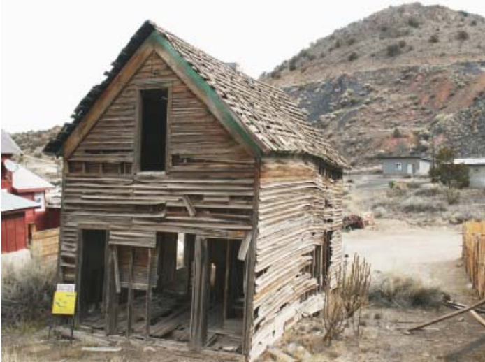
On the outskirts of town, some of the original company structures are waiting for some TLC. The original wood-frame cabins were dismantled in Kansas and brought to Madrid by train.

Since the 1980s, the New Mexico Abandoned Mine Land Program (NMAMLP) has safeguarded most of the hazardous abandoned coal mine openings at Madrid. The Program has also completed projects to control erosion, control subsidence, improve stormwater drainage and reclaim gob piles. Much of the townsite is built on or adjacent to coal gob piles, with associated problems including windblown dust, accelerated erosion and sedimentation, poor localized stormwater drainage and a destabilized stream system.