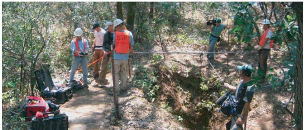
California’s Abandoned Mine Lands Unit staff and the “Dirty Jobs” film crew check the feed from a down-hole video camera lowered into an abandoned mine shaft

By Don Drysdale California Department of Conservation, Public Affairs Office (Modified from article first published in What’s Up, DOC? Volume 9, Number 9.)