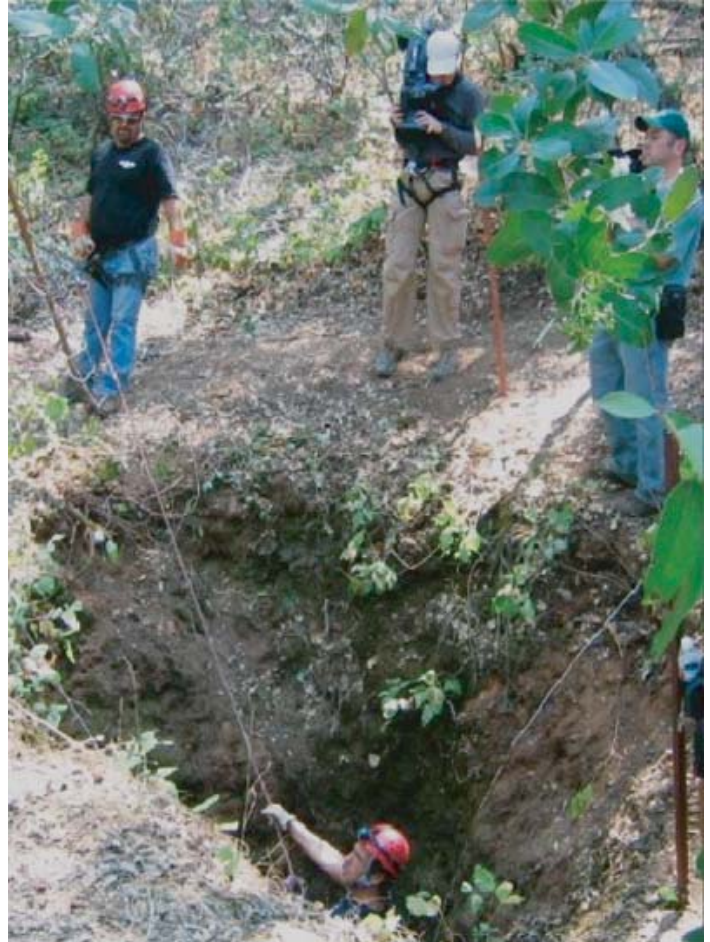
Show host Mike Rowe descends into the 50-foot-deep shaft.

One thing that seems safe to say after his work with OMR: With a newfound respect for the danger (and dirt) that comes with plugging an abandoned mine, Rowe will never get injured by venturing into one.