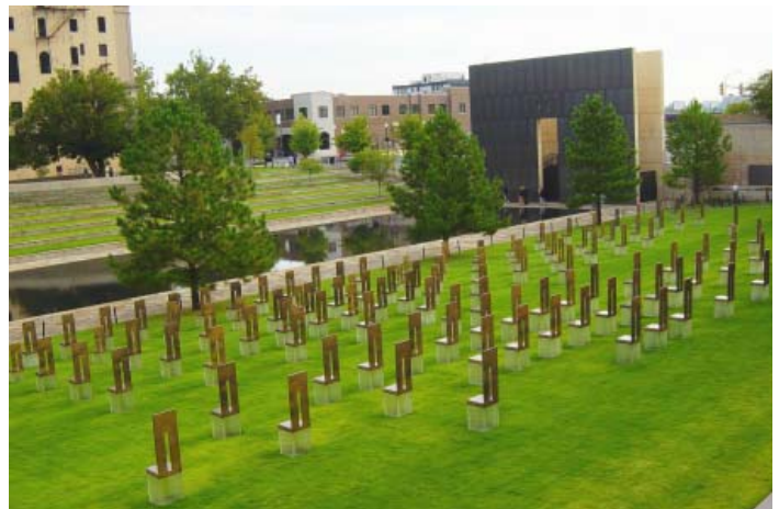
The Field of Empty Chairs, east Gate of Time, & Reflecting Pool at the Oklahoma City National Memorial.