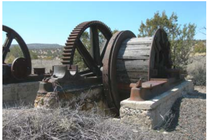
Old machinery and foundations, like the gears and pulleys from the original coal tram, dot the landscape in Madrid.

NMAMLP is currently evaluating proposals from planning, landscape architecture, and engineering firms to develop a community plan to prioritize and address problems arising from past coal mining practices in and near Madrid. NMAMLP is interested in exploring creative and innovative ways to address the impacts of historic coal mining at Madrid, while honoring its historic heritage and the goals and aspirations of the present community. The planning process will start with the identification of stakeholders; the development of baseline descriptions of the historical, social and physical aspects of the community; and the creation of an inventory of the problems associated with past mining practices, including public health and safety issues, physical dangers and degraded land, water, wildlife and recreational resources.