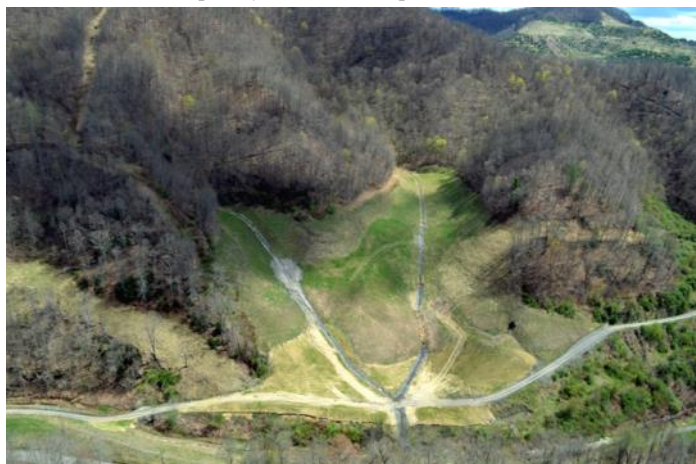
2015: Pile completely removed and planted with native hardwoods