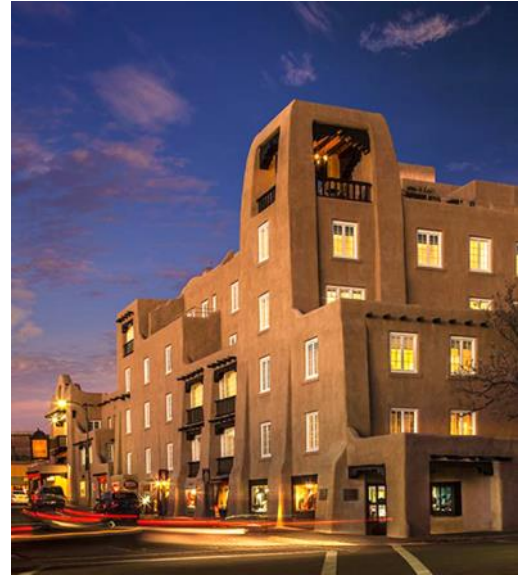
La Fonda on the Plaza

If the La Fonda Hotel gets booked to capacity, the La Posada de Santa Fe will be used as an overflow hotel option.