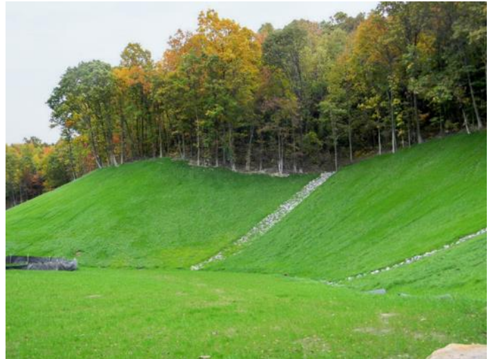
Backfilled high wall with armored drainage

the Boy Scouts arrival. This patch quickly became a "hot commodity" at the Jamboree and resulted in over 1,000 Scouts, leaders and volunteers becoming AML educated over a period of 10 days. For years to come, this reclaimed abandoned mine land site will provide public education and outreach for AML programs at a scale larger than could have previously been imagined.