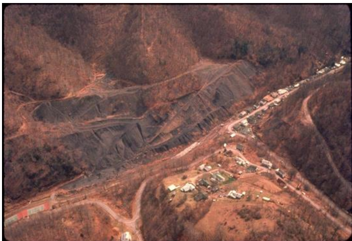
1982: This 12 acre P2 DPE feature slid in 1943 covering portions of the adjacent coal camp

Personal stories in Memories from Dante: The Life of a Coal Town recall heavy spring rains of June 16, 1943 and a disastrous slide from a coal waste or gob pile. Material from the lower Straight Hollow gob pile pushed a two-family house off its foundation and moved it onto railroad tracks. The stories relate the miraculous survival of an eighteen month old girl and a bird dog called Lady.