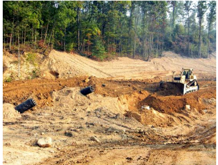
Bat friendly mine closure extensions

future construction by others of the planned (SBR). This reclamation work was done in consideration of the plans for the camp in order not to disrupt, block, delay or add to the cost of the future construction. Plans for the future Scout Camp were being changed continually, so the construction plans for the AML work was adjusted accordingly and necessary. The majority of the area was heavily timbered. Therefore cutting and stockpiling the timber, along with burning the remaining organic material, was a major task.