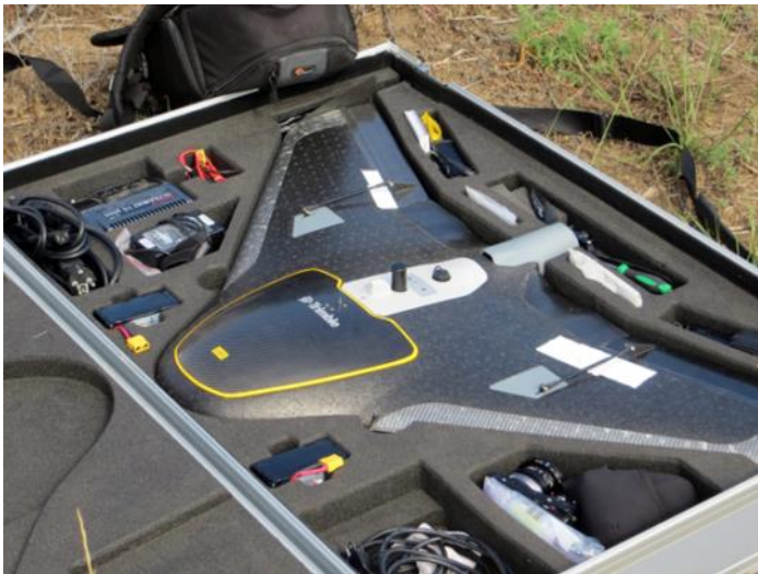
Figure 1. The Trimble UX5 Aerial Imaging Rover used in aerial mapping.

The State of New Mexico Abandoned Mine Land Program (N.M. AMLP) is exploring remote sensing techniques to monitor change in land cover and stream morphology at reclamation projects. Unmanned aircraft systems (UAS) promise high resolution imagery, flexible deployment, and relatively low cost at focused areas. We examined the use of an UAS to supplement revegetation and stream channel morphology monitoring at the Dillon and Dutchman Canyons, once part of a larger coal mining site, of Vermejo Park Ranch in northern New Mexico. As a result of N.M. AMLP geomorphic reclamation work, meanders and dynamic stability have been restored to sections of streams once straightened and degraded by historic coal mining practices. Coal waste had been redistributed and covered with topsoil by earth moving equipment, drainages added, and conditions created to reestablish wetlands to mitigate net loss. Seeding, planting, and natural establishment of native plants were used in the process of revegetation. Due to record rains within a year of the finished reclamation efforts, the area experienced flooding that scoured the planted stream channel. The dynamic nature of weather and its impacts on the rate of revegetation necessitates adaptive on-ground monitoring and invites the use of frequent remote sensing methodology for that purpose.