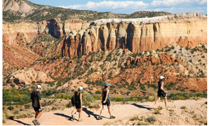
Hiking around Santa Fe

Technical Sessions -Conference ends at noon