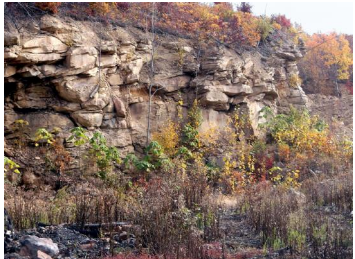
Typical dangerous high wall prior to project

This area was a dangerous attraction to local ATV users, hunters, campers, and hikers, and was visited frequently. Large numbers of ATV trails crisscrossed the area adjacent to the unstable highwalls and up steep embankments. Riders could have easily been injured or killed by rock falling from the highwalls or overturning ATV's. This area was planned to be used by the Summit Bechtel Reserve (SBR), home of the Boy Scouts of America Camp Arrow for a national high adventure camp. These hazards had to be quickly eliminated prior to construction of the camp to eliminate hazards to construction workers and the tens of thousands of participants associated with the camp.