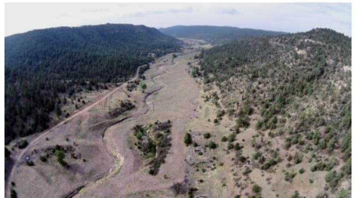
Figure 2. The new stream pathway after geomorphic reclamation of Dillon Canyon, Vermejo Park Ranch, as seen by an unmanned aircraft from approximately 600 feet high above ground, clearing utility lines and the highest peak.

A Trimble UX5 Aerial Imaging Rover, fixed wing UAS with 1 meter wing span and electric pusher propeller (figure 1), was deployed at the site in August, 2014. A 16.1 MP compact camera with custom 15mm lens was used to take high-resolution images along a programmed flight-path over the 0.16 square mile reclamation site in approximately 30 minutes (figure 2). The resulting data was used to map topography of the post-construction reclamation as well as assist in revegetation